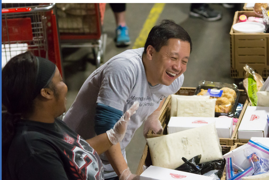
Mercedes Benz Financial Services