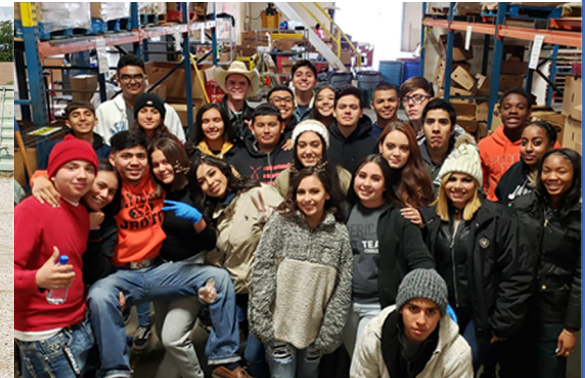
Polytechnic High School