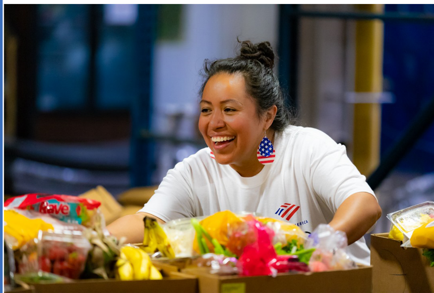
Bank of America