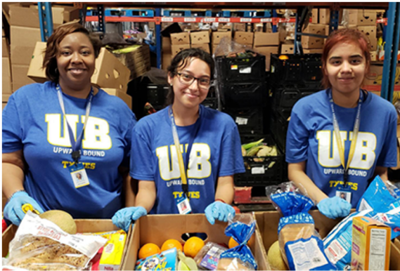
Texas Wesleyan University