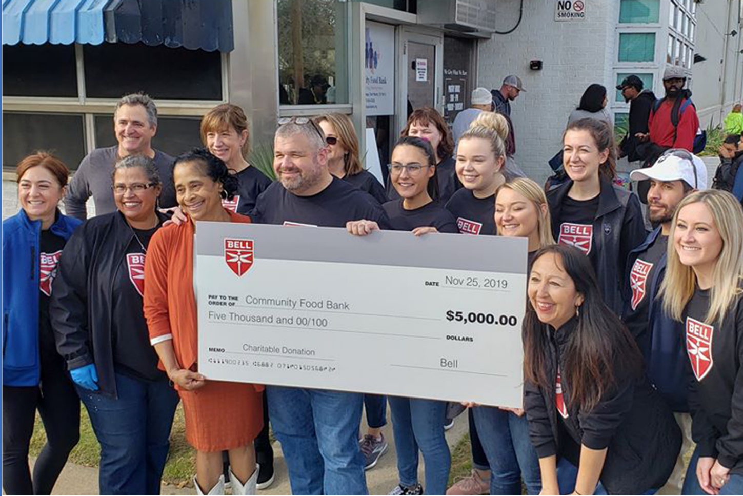
Bell presented us with a check toward the purchase of Thanksgiving turkeys.

Donations: Ajinmoto Foods, Albertson Distribution Center, Blount Fine Foods, Borden's Milk, Burlington Northern Santa Fe Railway, Bustillies Trucking, Cardona Foods, CAX Freightliner, Chavez Transportation, Classic Foods, Coca-Cola, Continental Express, Country Fresh, Dean Meats, Del Monte Foods, Dr. Pepper, Elston Solutions, Feed the Children, FosterFarms, Fyffes North America, Good-360, Grainger, Harvest Hill Beverage, Heyl Truck Lines, Hillshire Brands, Hirsch Bach Motor Lines, Hope Supply Company, Humane Society of North Texas, Inmar, Jana Manufacturing, JB Hunt, Kraft Foods, Lawler Foods Loads of Hope, Old Dominion Trucking, Operation Blessing, Pepsi, Performane Food Group, Prime Distribution, Purina Pet Food, Rico's Manufacturing, Salvation Army, Schneider Trucking, Seafood Supply, SEC Transport, Society of St. Andrew, SOS International Trucking, Swift Transportation, Tarrant Area Food Bank, Tarrant County Labor Detail, Tarrant County Sheriff's Department, Trader Joes, Tyson Foods, Union Gospel Mission, US Foods, Vital Farms, Walmart, Walmart Distribution Center, Westrock, White Wave Foods, Wise Foods, World Class Distribution, World Vision, & WP Rawlings.