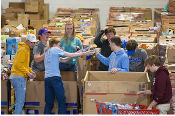
Trinity Valley School