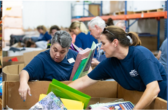
All Saints' Episcopal School