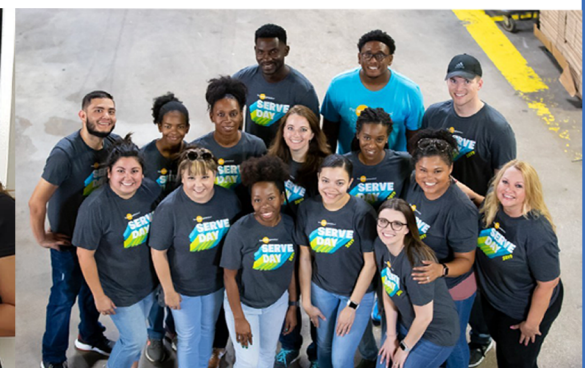
Pacific Dental Services