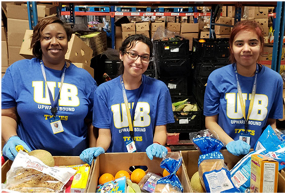
Texas Wesleyan University