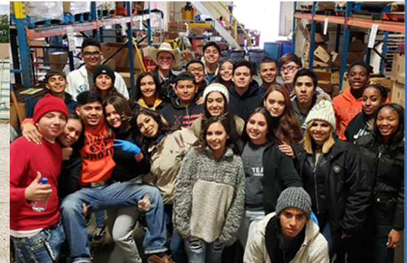
Polytechnic High School