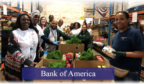
Bank of America