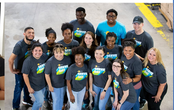
Pacific Dental Services